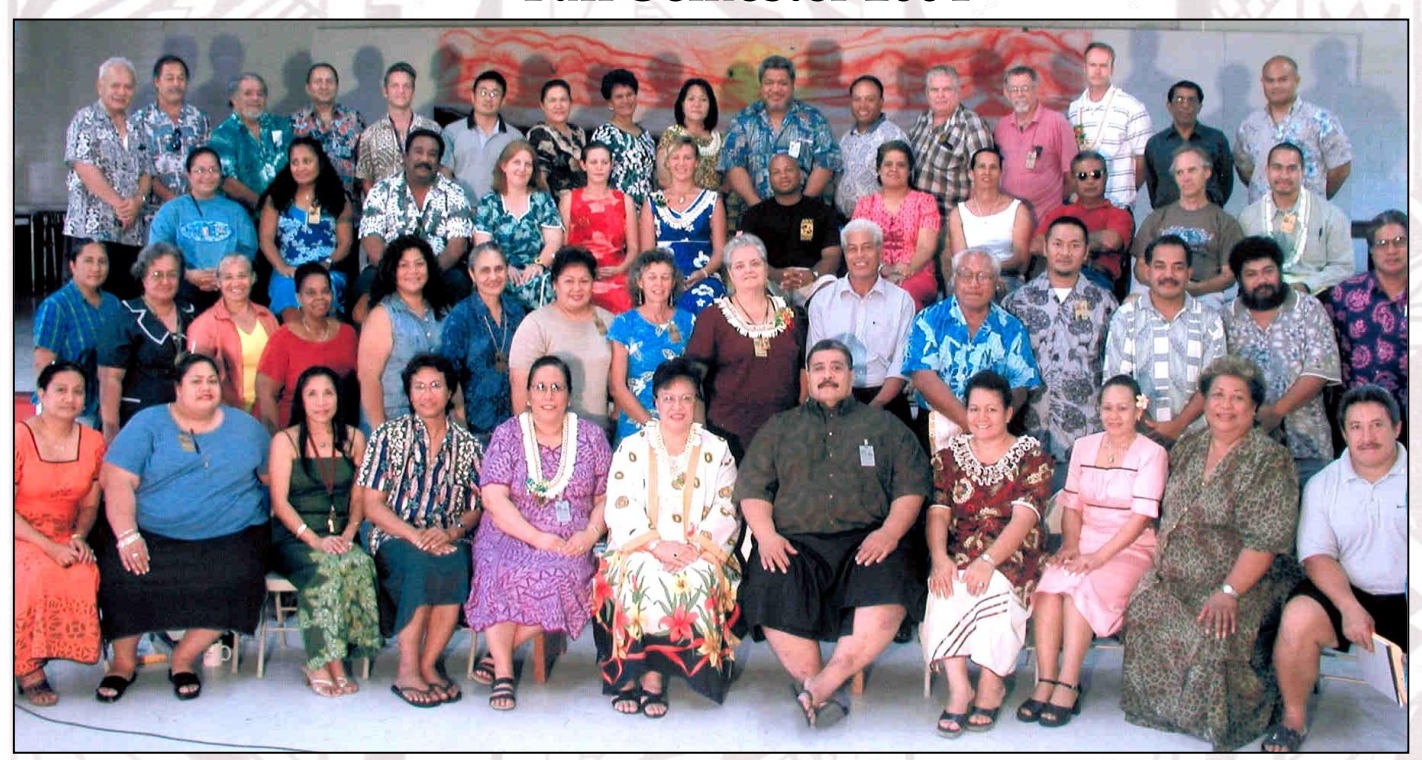
Spring Semester 2006