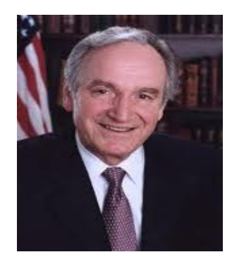
A photo of Senator Tom Harkin (D) from Iowa State

abilities are leaving the labor force during this recession at more than 10 times the rate of adults without disabilities. Harkin called on the CEOs and business owners in the audience to join him in his goal of increasing the number of disabled Americans in the workforce from 4.9 million today to 6 million in 2015.