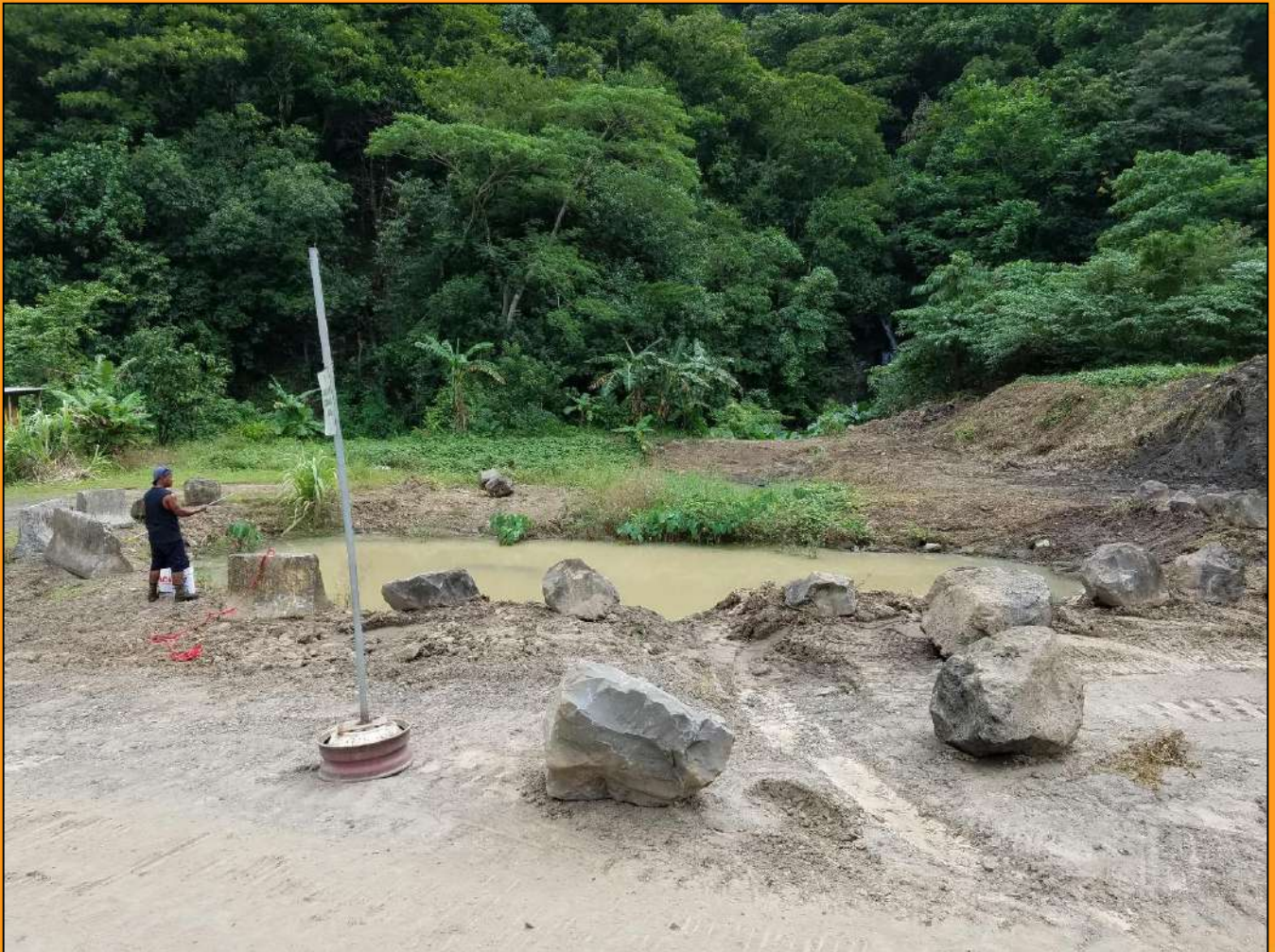
Niela Leifi of ASCC-ACNR assessing a potential mosquito breeding habitat at Fagaalu quarry. Fortunately, no disease-carrying mosquitoes were found at the site.

ACNR Assists CRAG and Fagaalu Village With Mosquito Assessment: ACNR Entomology staff visited Fagaalu village at the request of the Fagaalu mayor and the Coral Reef Advisory Group to help address concerns about possible mosquito breeding in some ponds in the village. The ponds were constructed near the quarry in the village to capture runoff and reduce flow of harmful sediments into the stream and out onto the reef. Fortunately it was found that the ponds were not producing mosquitoes known to carry human diseases in American Samoa. ACNR emphasizes that the mosquitoes that carry diseases in American Samoa breed in water-holding containers such as drums, buckets, used tires, etc. It's important for all of us to do our part to prevent dengue by getting rid of these kinds of items around our homes, schools and workplaces.