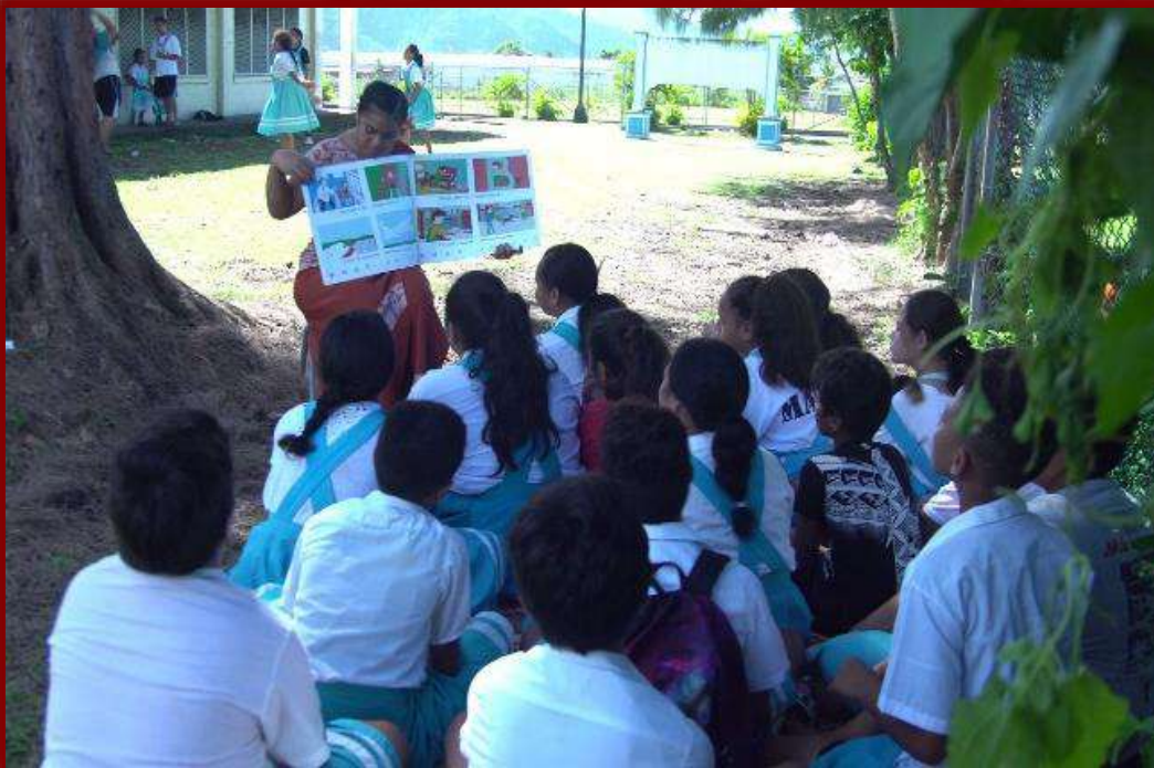
The SSI staff assisted TED with some filming for their Promotional Video. They went to Tafuna Elementary and filmed one of the instructors there.