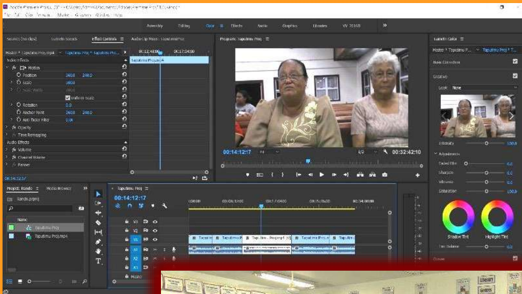
Editing video for SSI outreach team for EFKSA Youth Taputimu.

The SSI Videography Service assisted our TED Program and SSI outreach team on their documentations.