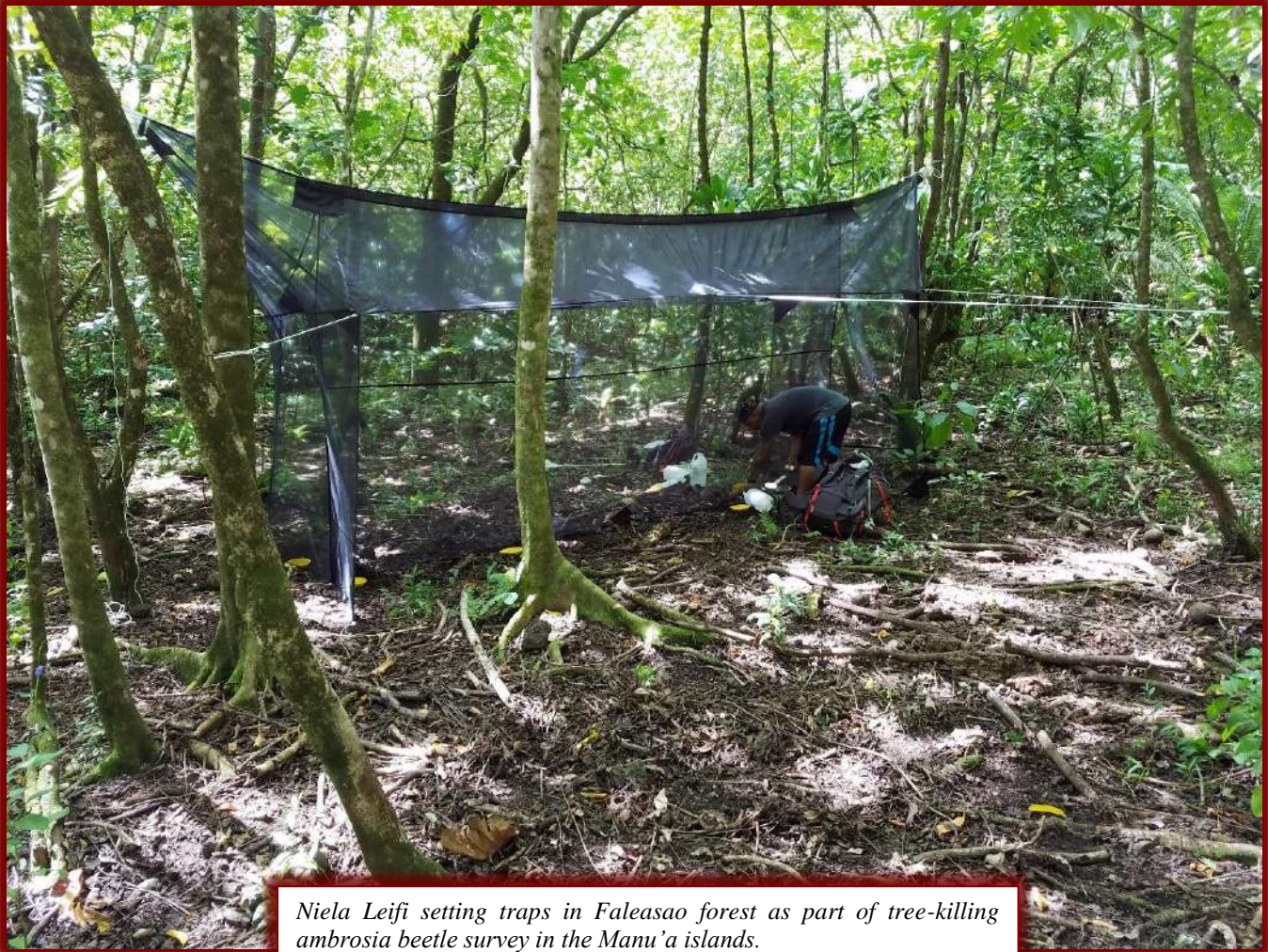
Niela Leifi setting traps in Faleasao forest as part of tree-killing ambrosia beetle survey in the Manu'a islands.