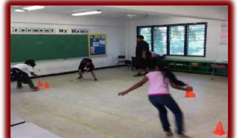
Preparing the Summer Lab School Learning Environment – Content Emphasis: Physical Education, Social Studies, Samoan, and Art.