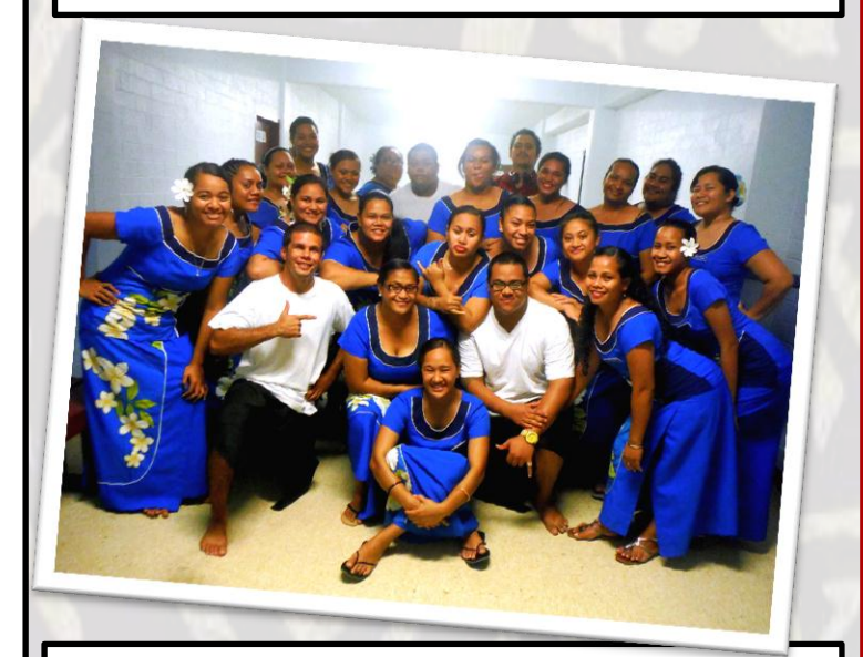
The Business Ambassadors of ASCC (BAOA) celebrate a successful performance before their parents and family at Parent's Night, presented by the Business Department.

To meet the standards set by the National Business Education Association, once a year a group of ASCC Business majors travels overseas to observe how goods are produced and distributed in a wide-ranging economy. With its diversity of small businesses producing a wide array of goods, the Independent State of Samoa has typically proved to be an effective and convenient site for this project, but on some occasions the ASCC students in the Marketing 212 class have traveled as far as New Zealand to visit factories and distribution operations. Funding these trips is a lesson in itself in planning, budgeting and effective sales, as the students who intend to take the trip initially secure a modest loan from their parents to purchase supplies for bake sales, then over the course of one or two semesters continue holding (Continued page 7)