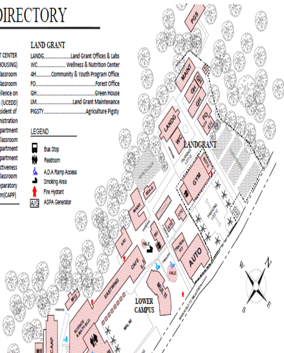
Figure 1: Credited to ASCC Architectural Drafting Technology program